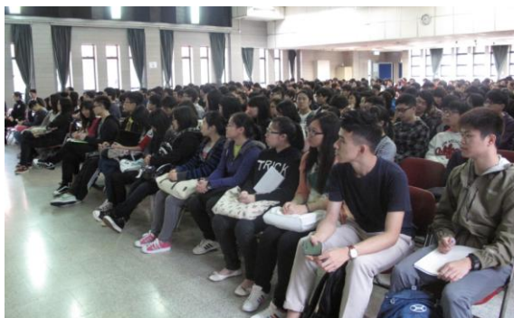
Around 400 students who have joined the competition took part in the seminar.