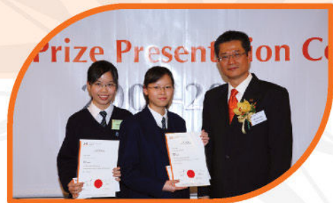
* Outstanding students receiving the HKIAAT Applied Learning Scholarship 優異生獲頒協會應用學習課程獎學金