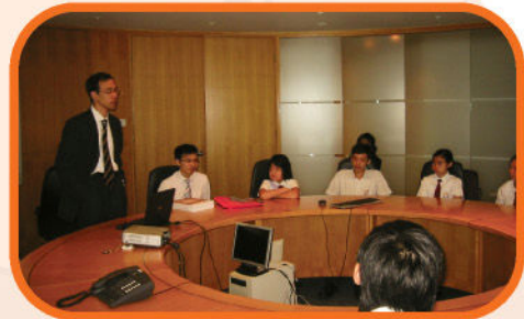
* CPA sharing his experience 會計師分享經驗