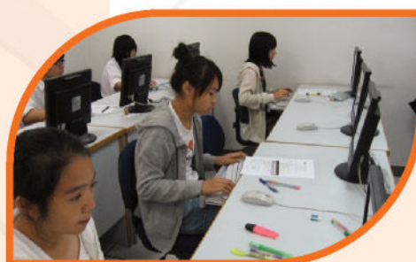
• Practising accounting software 實習會計軟件

課程以中小企業的日常運作為藍本，通過不同情景及會計軟件應用，讓學生了解整個會計循環及各類中小企業不同的會計運作。