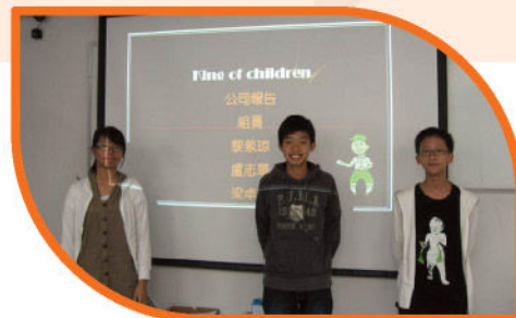
* Presentation 演示匯報