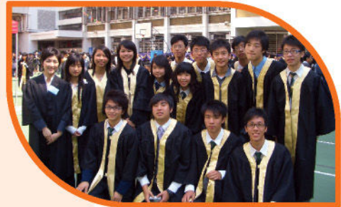
• Graduating! 畢業了!