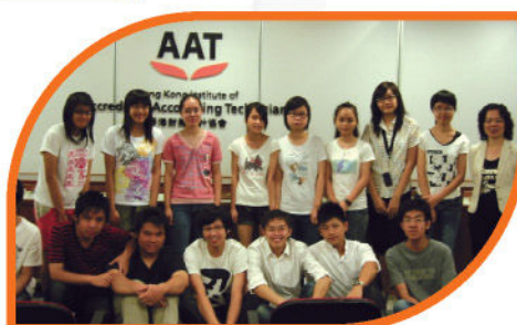
• Visiting HKIAAT 參觀HKIAAT

香港財務會計協會有限公司於一九八八年成立，是香港會計師公會（香港唯一法定專業會計師註冊組織）的直屬機構。